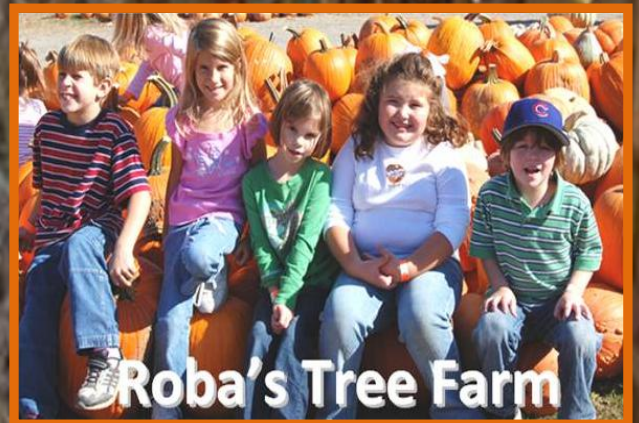
Roba's Tree Farm

ALL Kindergarten students must have handed in their permission slip in order to attend!